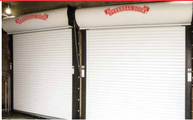
White finish. Installation and service: Overhead Door Company of Concord

When overall performance and thermal efficiency are as essential in a rolling service door as are versatile good looks, the Stormtite™ 625 meets specification and exceeds all expectations. This heavy-duty door features insulated slats in a variety of materials – galvanized steel, stainless steel or aluminum – and offers optional wind load protection up to 170 psf. Designed to fit openings up to 30'4" wide and 28'4" high (9246 mm x 8636 mm) and offered with a broad range of product options, the versatility and functionality of the Stormtite™ 625 ensures that your design requirements will be met with ease, functionality and style.