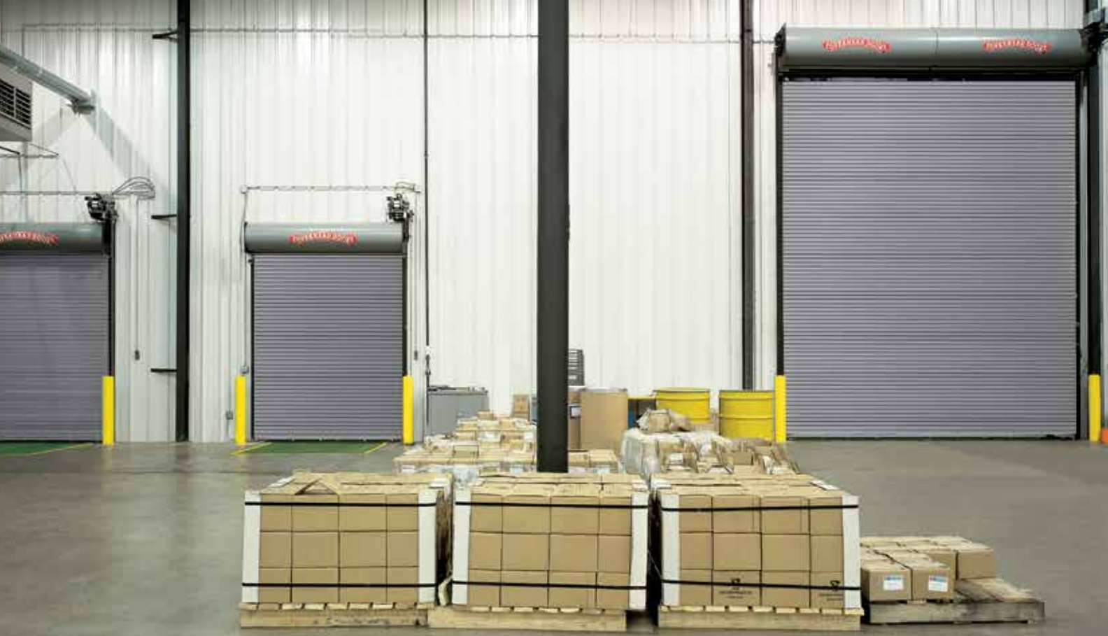
Gray finish. Installation and service: Overhead Door Company of Huntsville