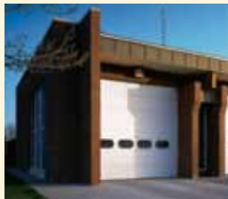
Thermacore® Sectional Doors