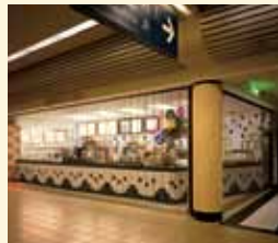
Rolling & Side Folding Security Grilles & Closures