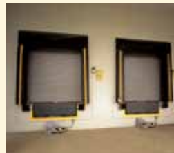
Rolling Service Doors