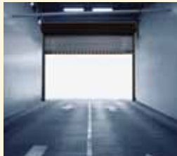
Advanced Rolling Steel Door RapidSlat®