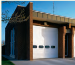
Thermacore® Sectional Doors