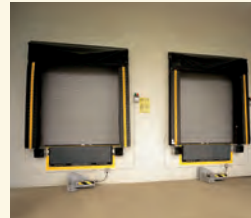
Rolling Service Doors