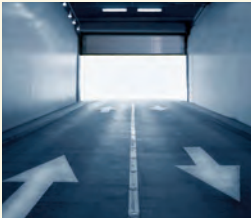
Advanced Rolling Steel Door RapidSlat®