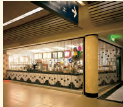
Rolling & Side Folding Security Grilles & Closures